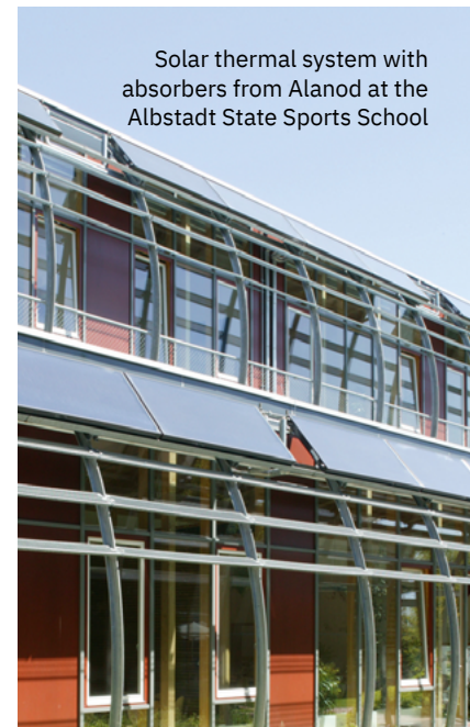
Solar thermal system with absorbers from Alanod at the Albstadt State Sports School