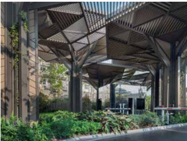
Riverside Gently in France. Facade made of DECO PRIME® 4 with FL01